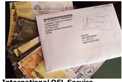
International QSL Service.