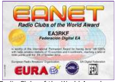
Radio Clubs of the World Award.