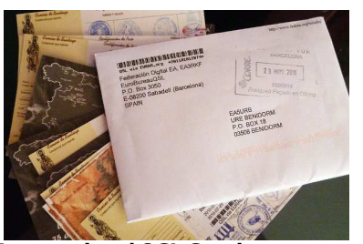
International QSL Service.