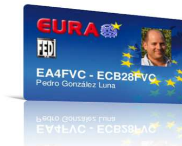
The European Radio Amateur Card