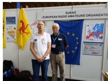
Preparing future HAMVENTION .