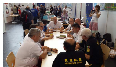
EURAO General Assembly 2016.