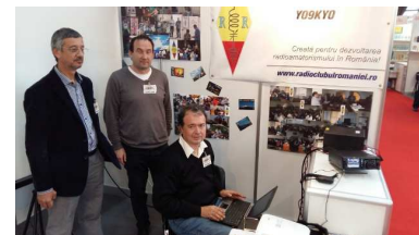
ARR, YO9KYO, at Gaudeamus Fair