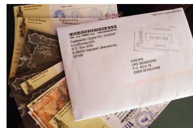
International QSL Service.