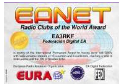
Radio Clubs of the World Award.