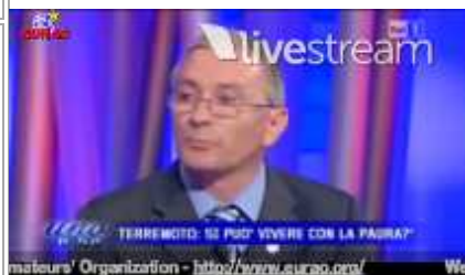
IW5CGM, President CISAR , on RAI 1 after Emilia-Romagna earthquake