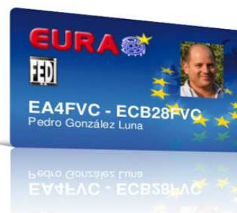
The European Radio Amateur Card