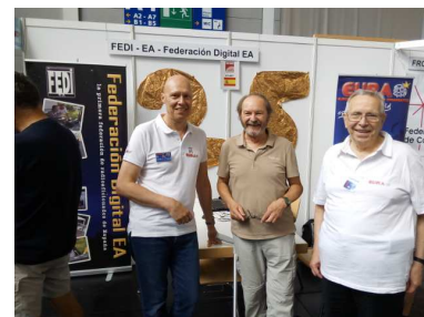
FEDI-EA at HAM RADIO 2017.