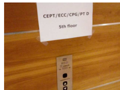
Preparing WRC-19 in CEPT .